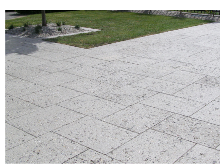
Mist Pebble Exposed Finish