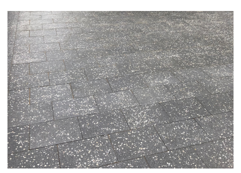
Ebony Pebble Honed Finish